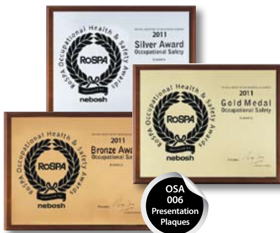
OSA 006 Presentation Plaques

Visitors, customers, suppliers and competitors will be instantly aware of your achievements with the RoSPA Award Winner flag and wall plaques – there is no better testimonial to your health and safety commitment.