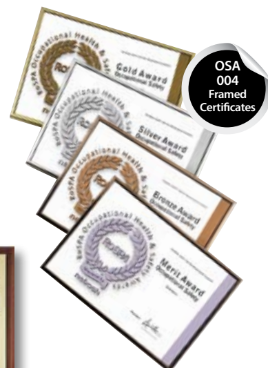
OSA 004 Framed Certificates