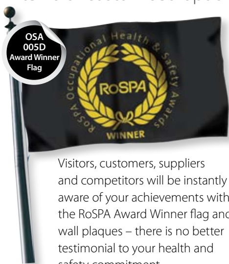
OSA 005D Award Winner Flag

Celebrate your health and safety accomplishments and highlight the success of your whole organisation. Choose from our range of standard Awards-branded items or customised options.