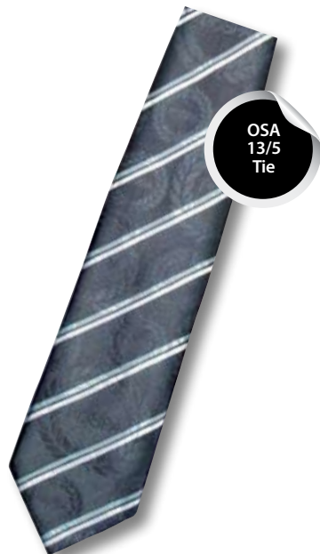
OSA 13/5 Tie