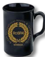
OSA 050 Lincoln Mug