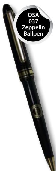
OSA 037 Zeppelin Ballpen