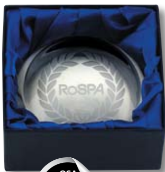
OSA 121 Lead Crystal Sloping Paperweight