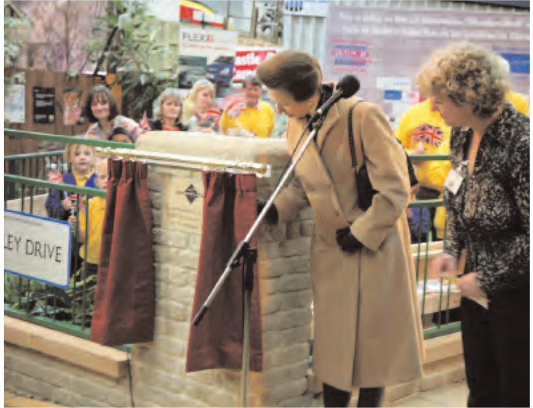
The Princess Royal commemorates her visit to Streetwise in Bournemouth