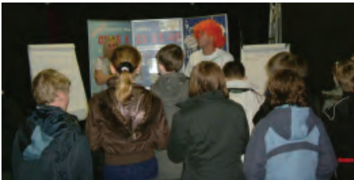
Children learned about the importance of emergency calls