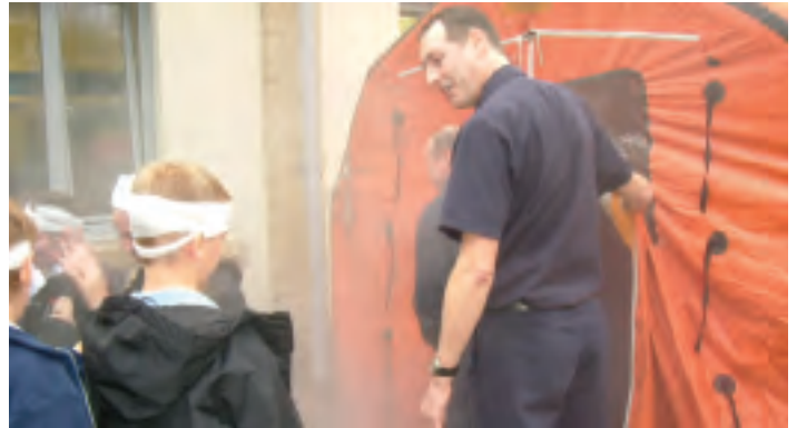
Children entering the smoke tent

The children could then explore the kitchen and shed to make it safer for younger children to visit. The falls preven-