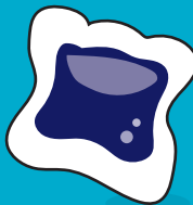
Liquid laundry capsules